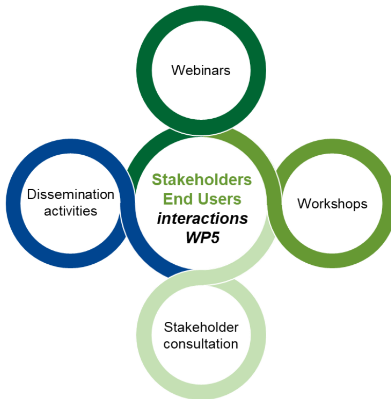
Figure 1. Framework for stakeholder and end-users interaction in WP5.