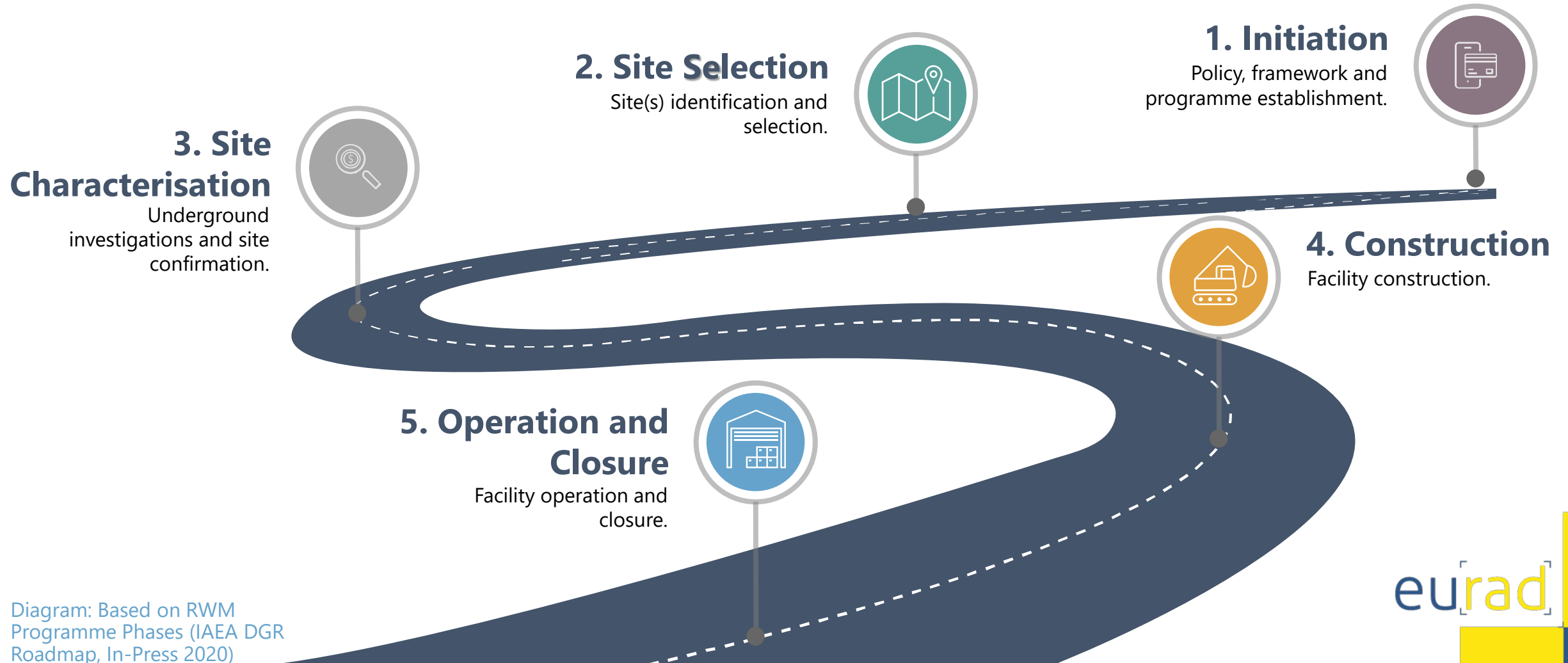
Diagram: Based on RWM Programme Phases (IAEA DGR Roadmap, In-Press 2020)

A generic representation of goals, activities, and knowledge needed, from waste generation to disposal